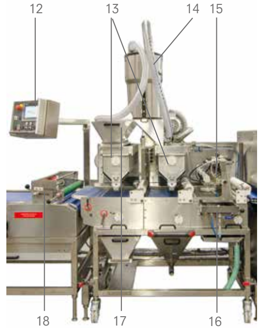
Wire belt module on a mobile frame - exchangeable with an optional conveyor belt